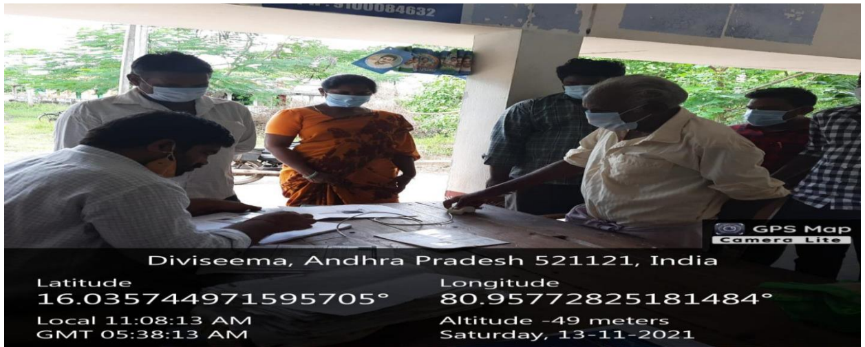
Awareness on e crop enrollment