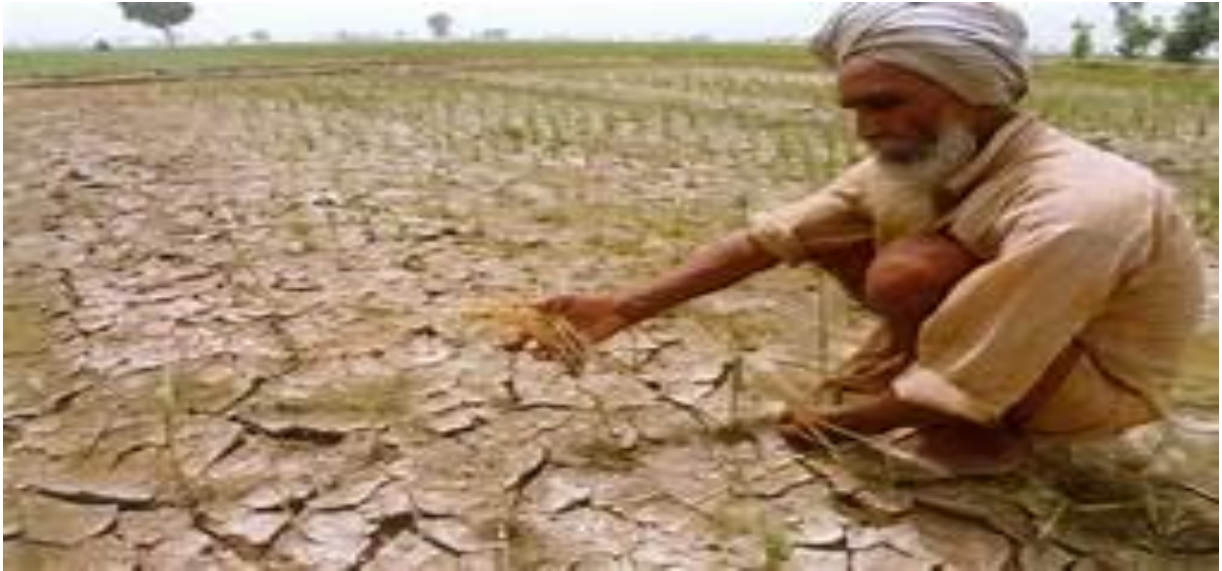
THERE IS NO RAIN DURING CROP SEASON