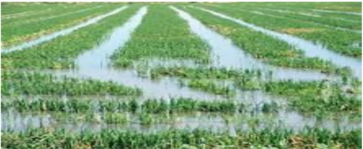
THE CROP IS MERGED IN THE RAIN WATER

Those two situations are creating the problem to the farmers in the cultivation